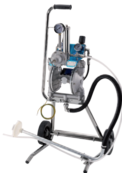
DPS Double Diaphragm Pumps

We offer a variety of pressure pots and pumps for any of your fleet application needs.